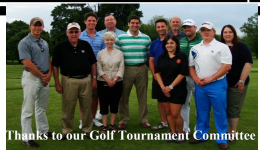
Thanks to our Golf Tournament Committee